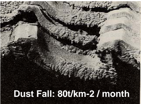
Dust Fall: 80t/km 2 / month