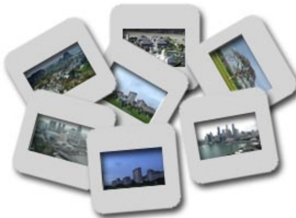
Environmentally Sustainable Cities in ASEAN